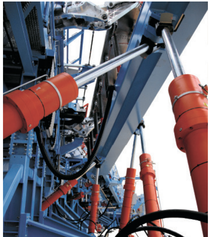
02 Ratio Clamp in use: Testing elements on aircraft wings

The clamping unit can also be easily combined with standard cylinders, products supplied by other manufacturers and other round rod applications. Proximity switches, that indicate whether the clamping unit is unlocked or locked, can also be integrated. A suitable hydraulic control block can also form part of a Ratio-Clamp solution. It guarantees consistent and functional control and reduces the number of switching measures.